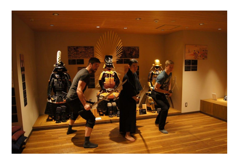
Fig. 2 Weapon Dance in Samurai Museum (https://matcha-jp.com/th/1736), 2019.