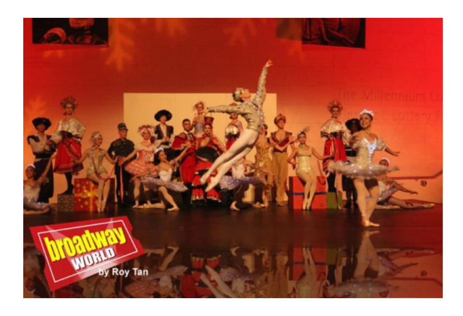
Fig. 3 performing arts in British Museum